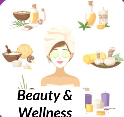
Beauty & Wellness