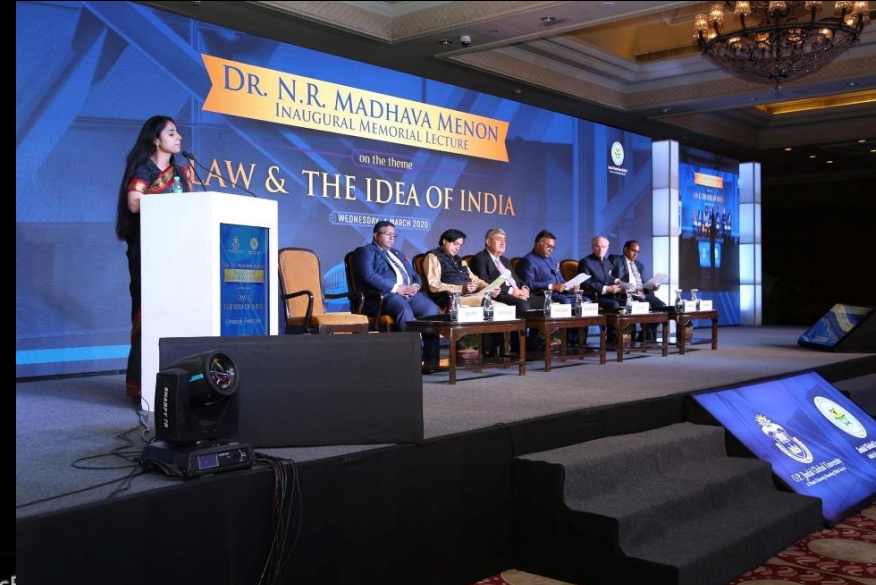
INAUGURAL LECTURE OF O.P. JINDAL SCHOOL WITH SHASHI THAROOR