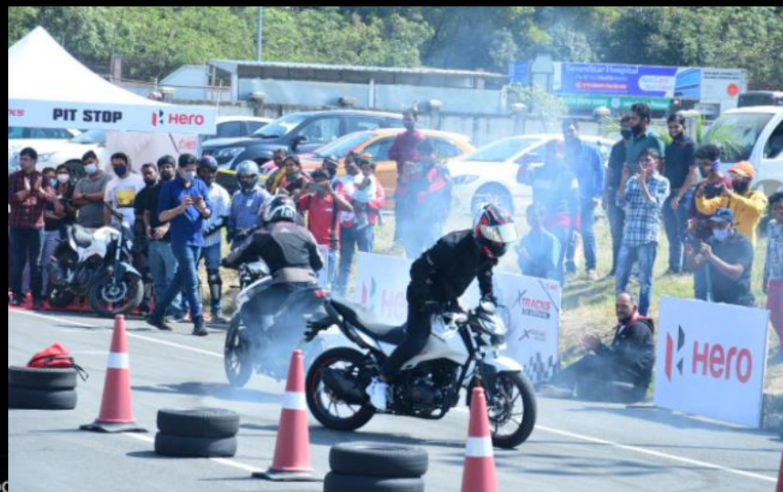
XTREME URBAN XTRACKS TEST RIDE AND STUNT SHOW