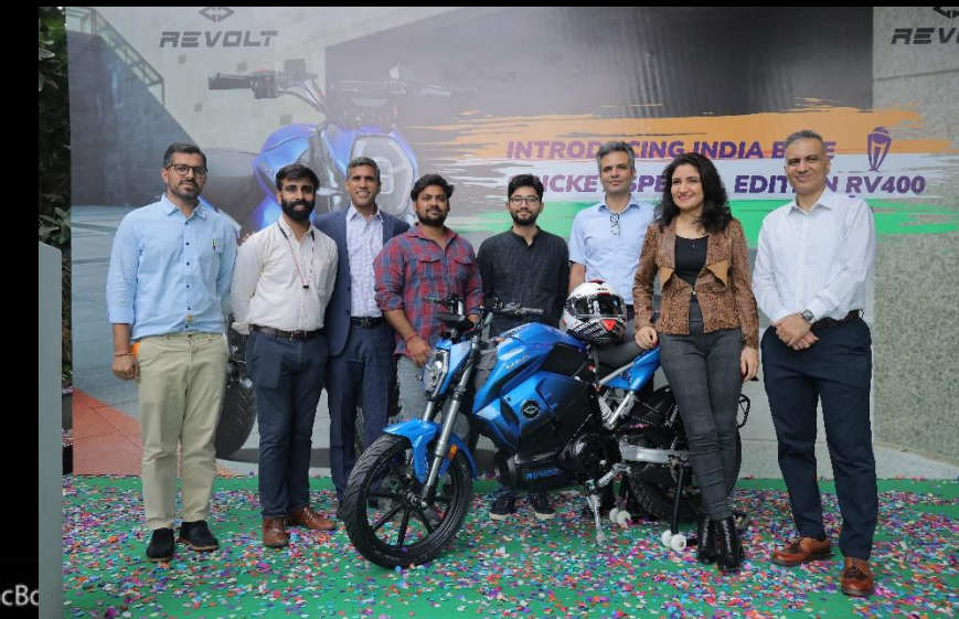
Bike launch of RV100 Revolt