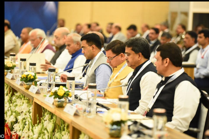
Chintan Shivir: PM Modi Pitches For 'One Nation