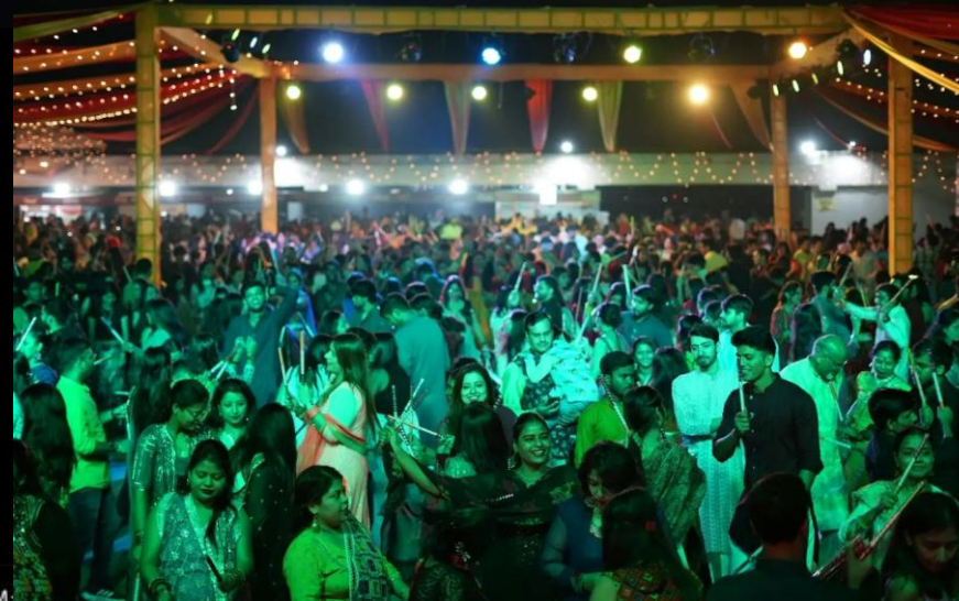
Pacific Mall Dandiya Nights