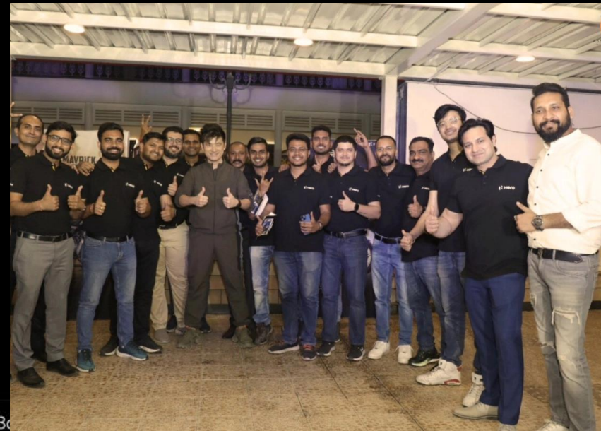
Launching of Xtreme 125R and Mavrick 440 Bike in Ranchi