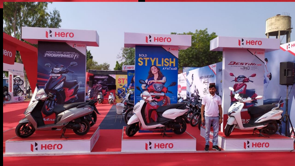
Hero : Krishi Darshan Expo 2017