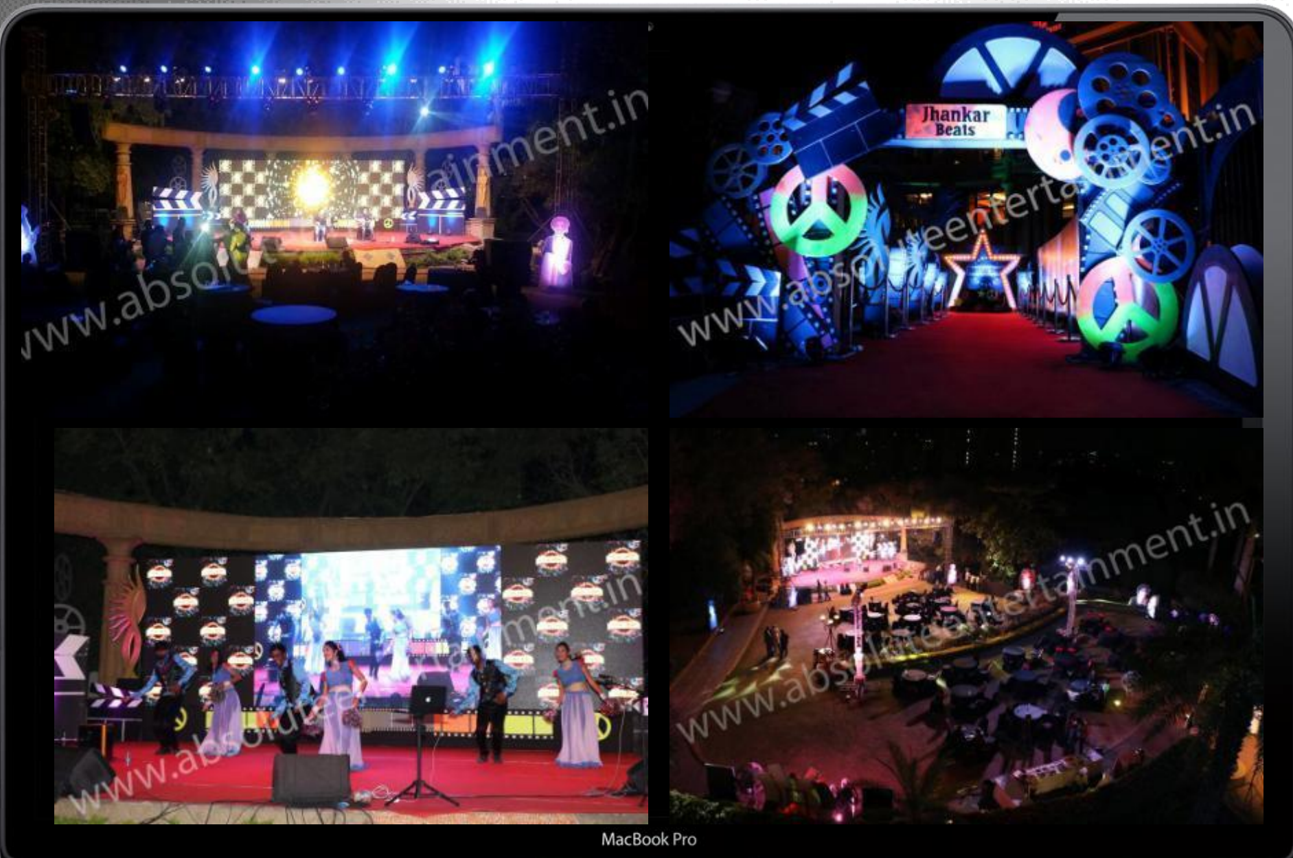
Customized event for 25th Anniversary (Theme – Bollywood)